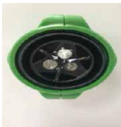
Nozzle #1 (Dirty)

Example below: Nozzle #1 (Dirty) & Nozzle #2 (Clean). Nozzle #1 has not been properly cleaned after being used. When not properly cleaned, residual chemical deposits build up on the sprayer nozzle. Deposit build-up results in decreased bar pressure and decreased spray patterns. The recommendation is that a full tank of water is sprayed through the unit after every few days of use to rinse any residual chemical build-up to reduce the chance of blockage.