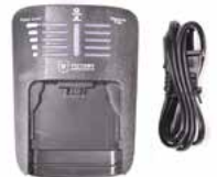
16.8 V Charger