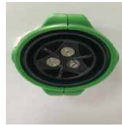
Nozzle #2 (Clean)