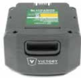
16.8 V Battery