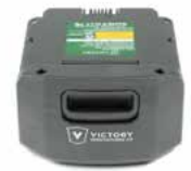
16.8 V Battery