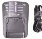
16.8 V Charger